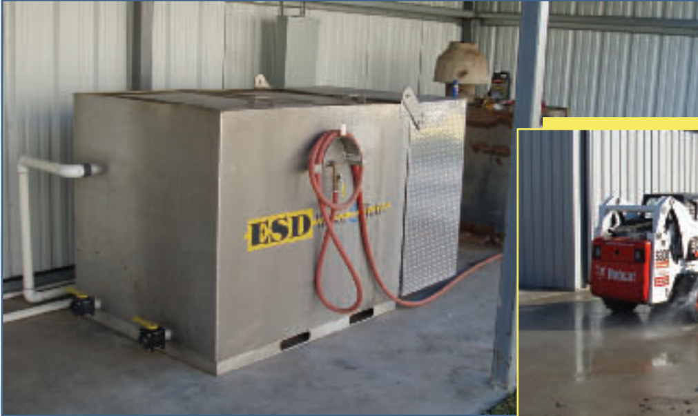
Model 750 Biological Recycle System and Pressure Washer