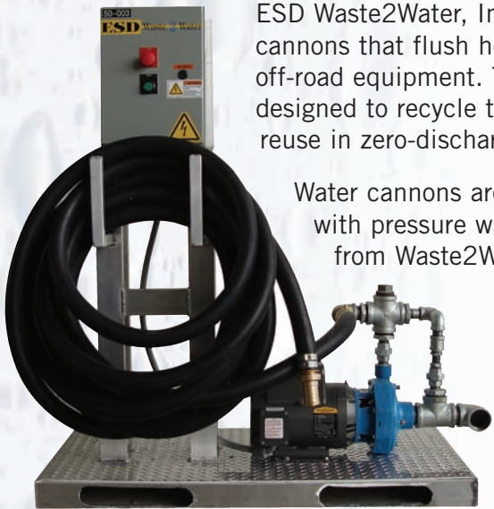
Skid Mounted Water Cannon Model 953

ESD Waste2Water, Inc. offers powerful water cannons that flush heavy mud and debris off of off-road equipment. The water cannons are designed to recycle the water from a mud pit for reuse in zero-discharge applications.